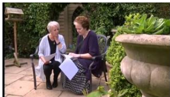
Enormous thanks to the Scott-Hunters for taking part.

We are looking for more families to be filmed, recorded and interviewed, to share their stories. (N.B. not just for TV but for our website and raising awareness too) If you can help, please get in touch.